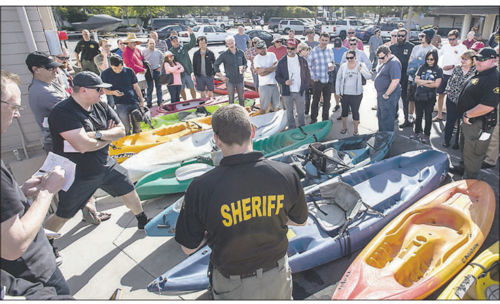
The crowd gathers as kayaks are auctioned off at the boat auction conducted by the city of Newport Beach on Friday morning at the Orange County Sheriff's Harbor Patrol office.